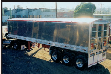
Roll over Side to Side tarps