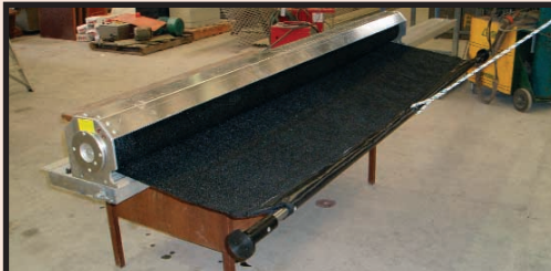
Pull Out Tarps