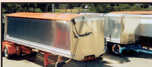
Electric and hydraulic kits for Roll Over tarps