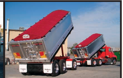
Wind out Front to Back Tarps